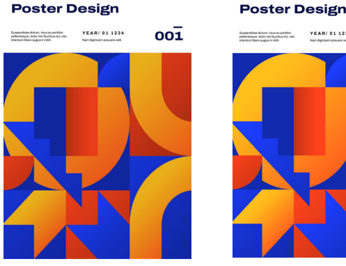
Printed with conventional colour