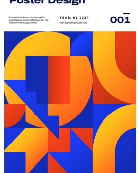
Printed with Vivid colours