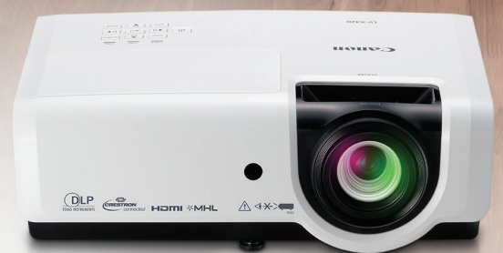
LV-X420 MULTIMEDIA PROJECTOR

Canon Projectors are designed compact, with brightness levels of 4200 lumens and Full HD (1920 x 1080) resolution for LV-HD420 , and XGA (1024 x 768) for LV-X420 . Ideal for multi-size presentations and lectures, enhanced brightness is matched with the BrilliantColor™ system and 6-colour wheel to give images a vibrant, impactful quality.