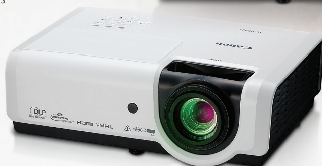
LV-HD420 MULTIMEDIA PROJECTOR