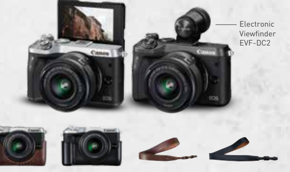
Body Jacket (Brown) Body Jacket (Black) Neck Strap (Brown) Neck Strap (Black)

For even more creative opportunities, choose from 3 selectable shooting intervals to shoot your favourite time-lapse videos.