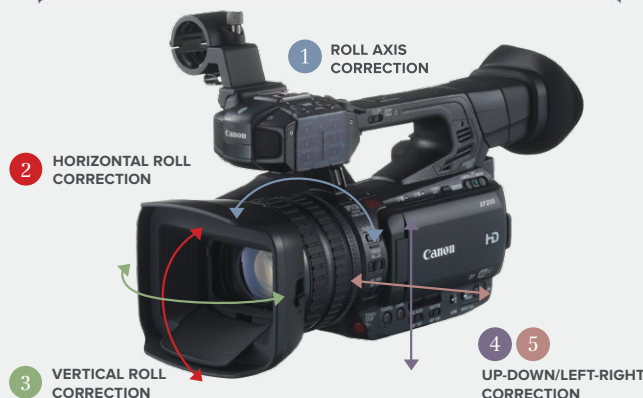
Image stabilization performance for steady and shake-free videos with handheld shooting

The HD CMOS PRO sensor supports the Genuine Canon 20x HD Video lens with a 1/2.84 inch 1920 x 1080 sensor. The sensor works with the DIGIC DV 4 image processor to produce high-quality images of greater depth with low noise levels, even when shooting under low-light conditions. The DIGIC DV 4 image processor also enables an improved image stabilization performance for steady and shake-free videos for steady and shake-free videos.